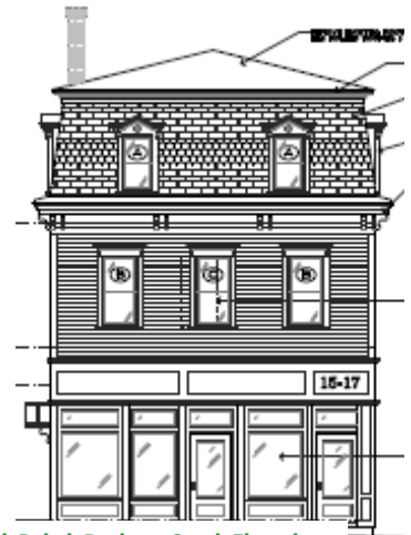
Proposed Rehab Design—South Elevation