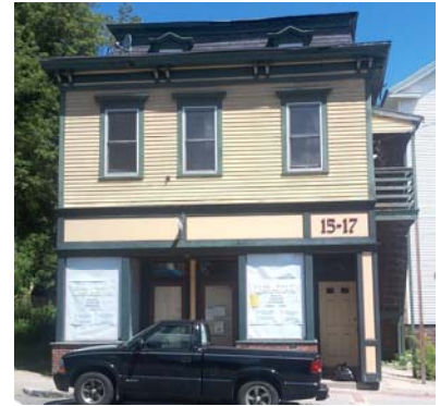
15-17 E. Main Street in Orange, MA

Those interested in supporting the Orange project can contact Phil Ringwood at 413-774-7054 ext 115 or at pringwood@dialself.org