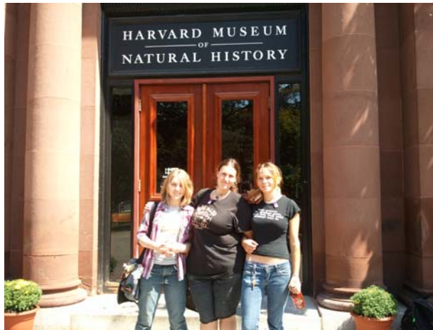
Step Program Participants visiting Boston

The program recognized youth this summer during an overnight adventure-based trip which included recognition events made possible through a mini-grant award through the Communities that Care Coalition. Many