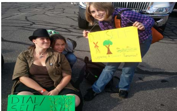
Step Program Participants get ready for the 2011 Franklin County Fair Parade

Staff are planning some new events like apple picking, haunted hayrides, and pumpkin festivals to enjoy harvest time!